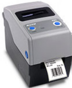
Sato bar code label printer, CG series

The following printers are tested and compatible with Realtime