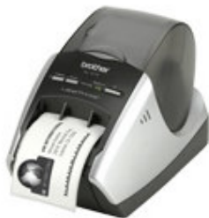
Brother QL-570 Picture for illustration only Retail price: SGD250.00

Go to http://www.satoasiapacific.com/products.aspx for more information